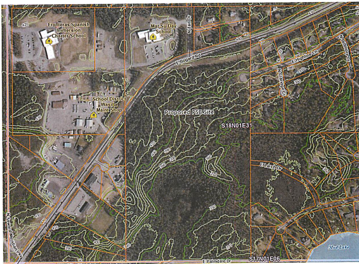
Figure 1: Bogard Road Site with Topography

A review of the DEC Contaminated Sites Database shows only one site with a documented history of contamination within a mile of the subject property. It is located approximately \frac{3}{4} -mile to the west, at the Alcantra Armory, and the investigation into the contamination has been closed.