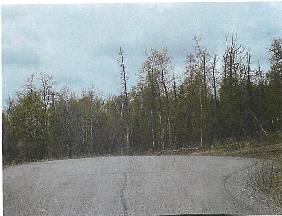
Photo 4 – Cul-de-sac on Highline Drive looking west onto subject property