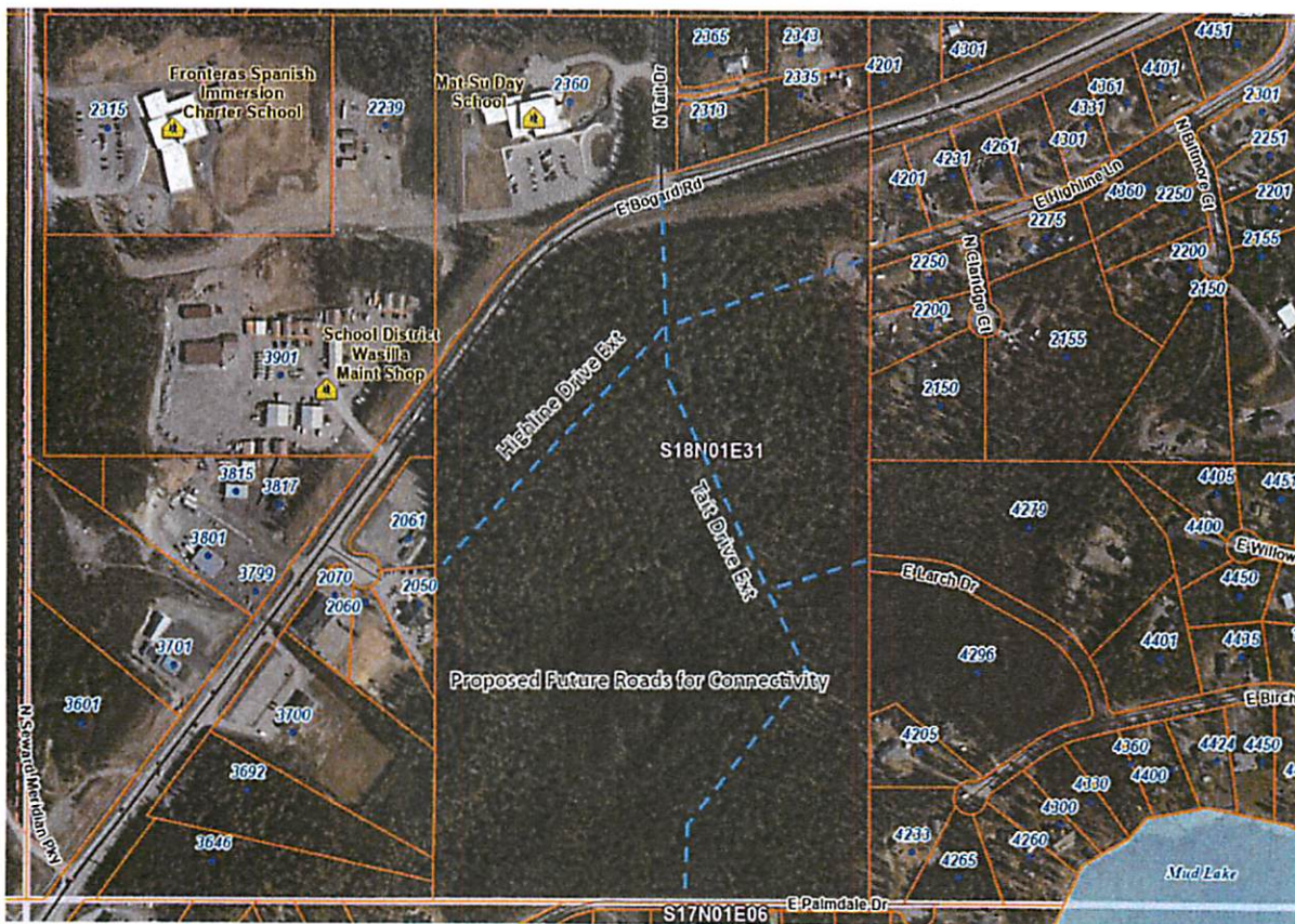
Figure 2: Proposed Future Roads for Local Connectivity on Bogard Road Site

Land should be set aside for future road to provide local connectivity and secondary access. See map below with a conceptual layout of local roads to be developed.