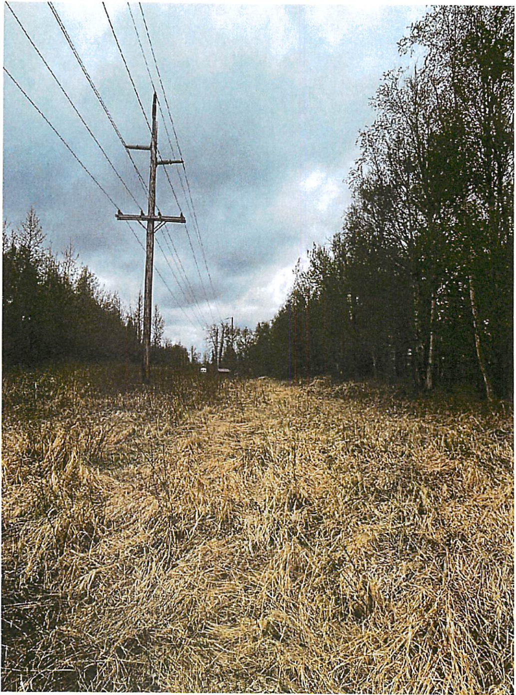
Photo 2 – Powerline on subject property near Bogard Road looking east