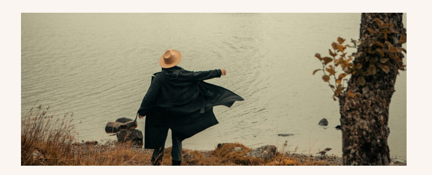
Access for All Ages