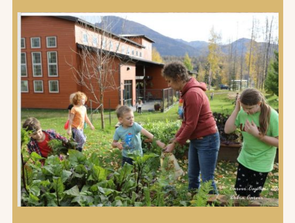
Space & Staffing